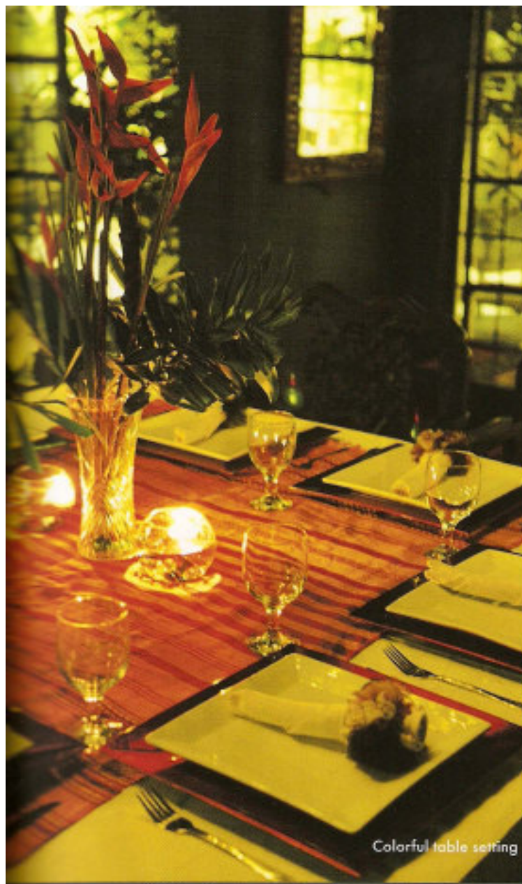
Colorful table setting