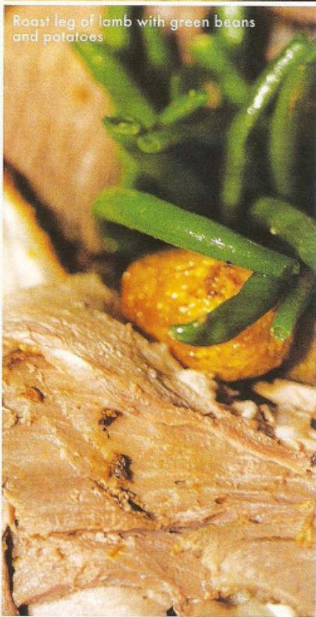
Roast leg of lamb with green beans and potatoes