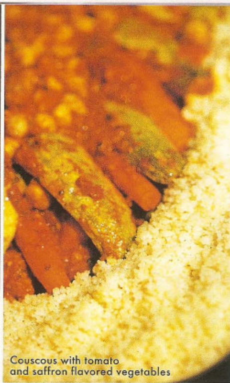
Couscous with tomato and saffron flavored vegetables