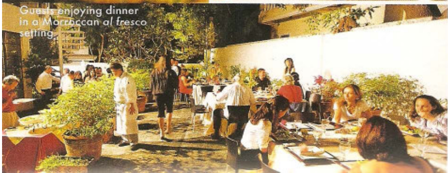
Guests enjoying dinner in a Moroccan al fresco setting